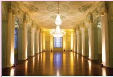
THE GEORGIAN BALLROOM